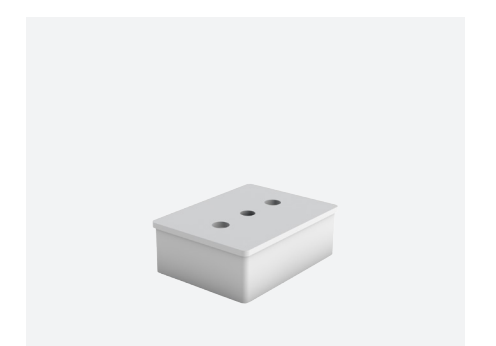
Standard with EPI Block Rectangular Foot